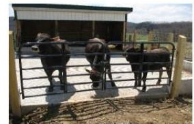
Animal Heavy Use Area