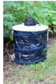
BG Sentinel Trap

If you have any questions or would like to learn more about our program, please feel free to contact us