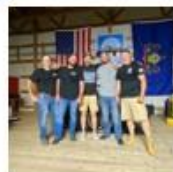
4 th Gear Band